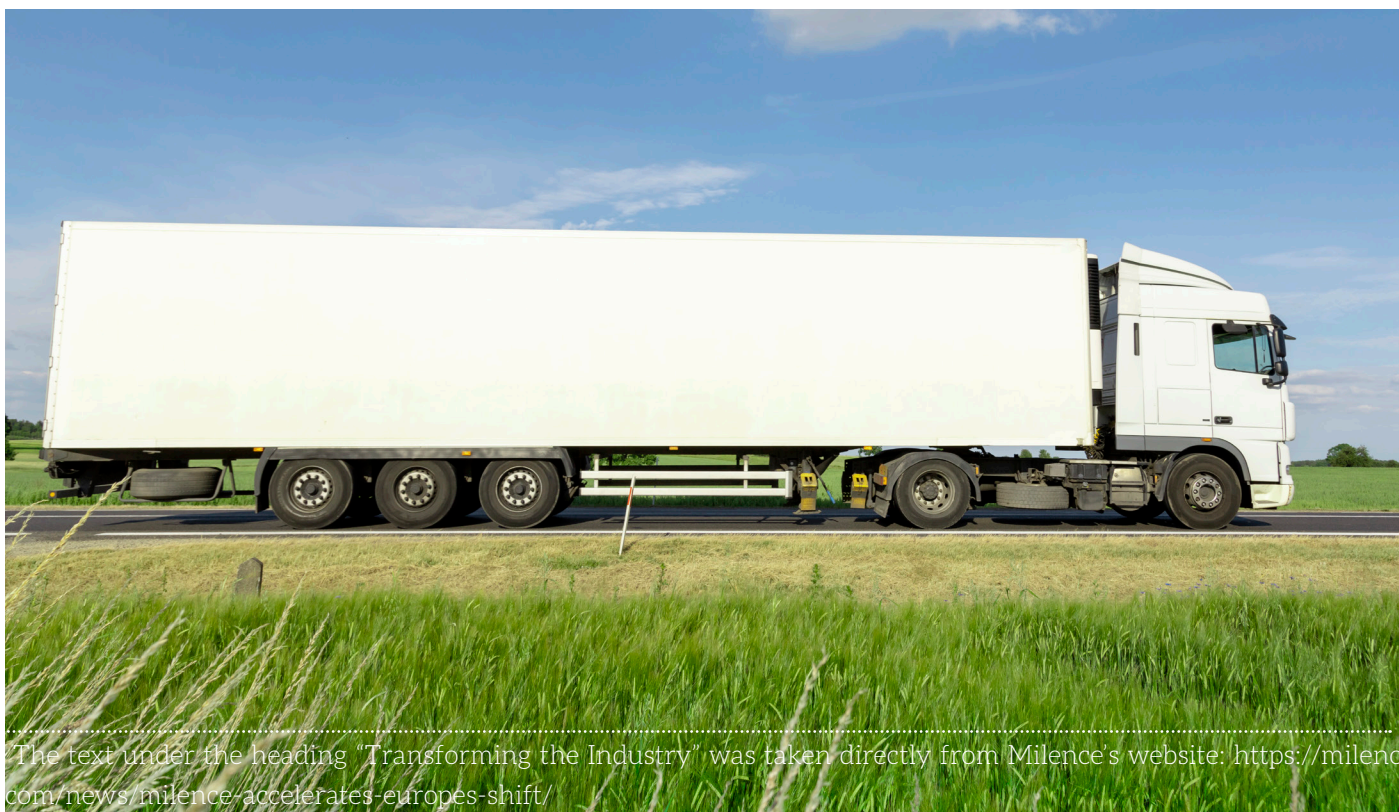
The text under the heading "Transforming the Industry" was taken directly from Milence's website: https://milence.com/news/milence-accelerates-europes-shift/